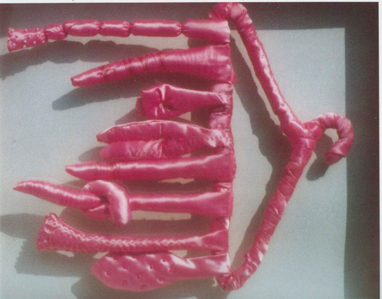
Fixed rate Thank you 2002 silk fabric, cotton, thread, beads 46cm x 52cm